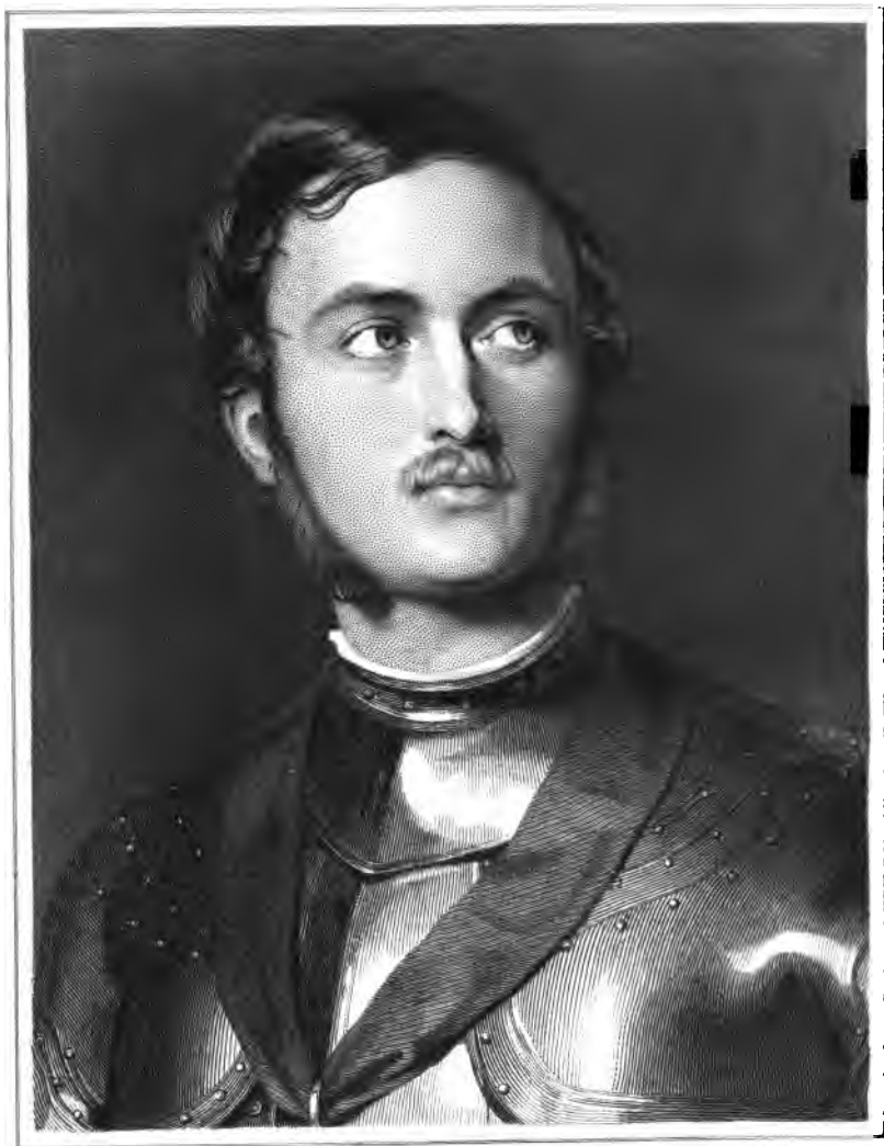
H. R. H. Prince Albert at the age of twenty-four